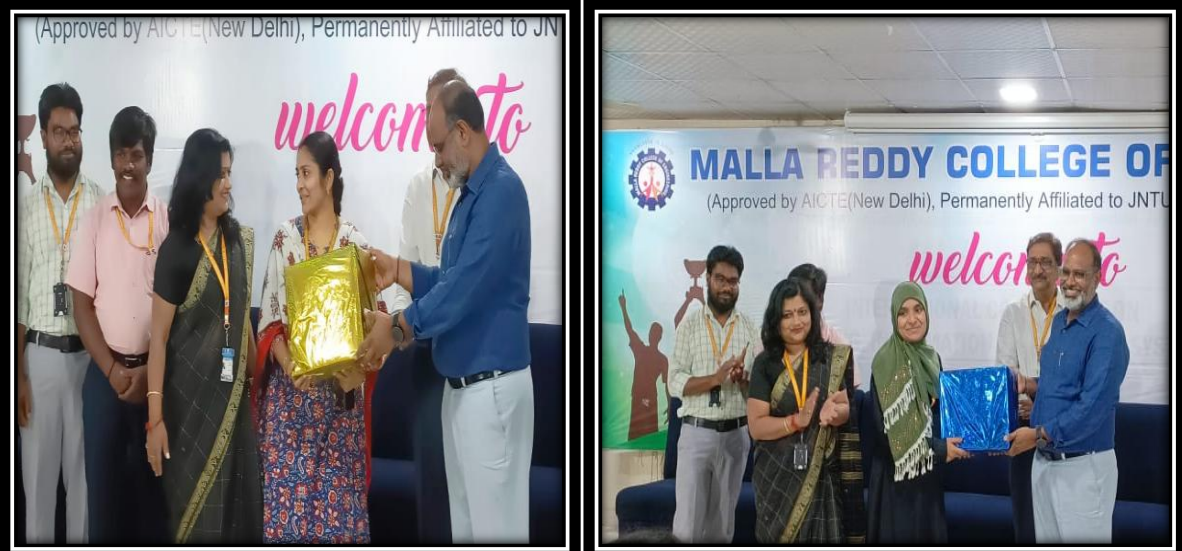
Class in-charges who received best Mentor Awards